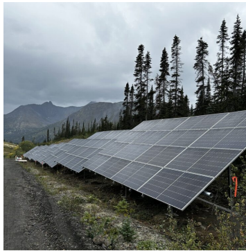
Solar and battery power system installation